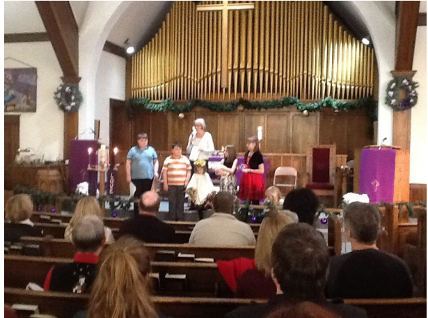
The Sunday School Christmas Program, “The Gifts of Christmas” went very well !