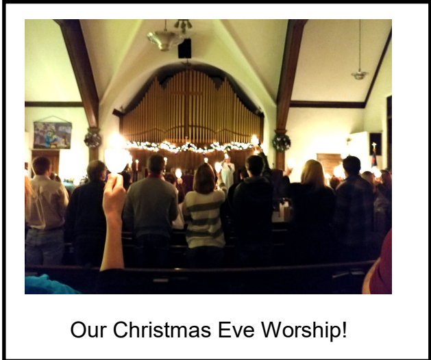
Our Christmas Eve Worship!